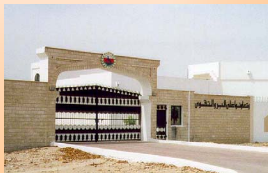
Physically Handicapped Supporting Center