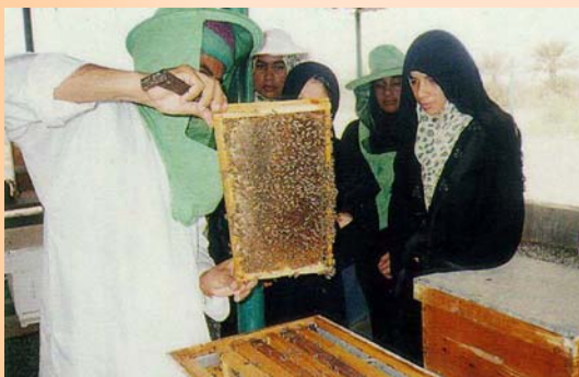
Training of Apiculture